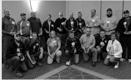
Award Recipients: Dedication to Excellence in Safety

A. D. Bowman & Son Lumber Co., Inc. Baillie Lumber Co., LP - Boonville Baillie Lumber Co., LP - Hamburg Baillie Lumber Co., LP - Smyrna Mill Baillie Lumber Co., LP - Smyrna Yard CCN International, Inc. Double Aught Lumber, Inc. Fitzpatrick & Weller, Inc. Greene Lumber Co., LP Lyndaker Timber Harvesting, Inc. McNeilly Wood Products, Inc. Mullican Flooring, LP Neville Manufacturing Service & Distribution, Inc. Pallet Services, Inc. Paul J. Mitchell Logging, Inc. Potter Lumber Co., LLC S. R. Sloan, Inc. Seaway Timber Harvesting, Inc. Wagner Hardwoods, LLC Wagner Millwork, LLC Wagner Nineveh, LLC Ward Pine Mill, Inc. Wightman Lumber & Building Supplies, Inc.